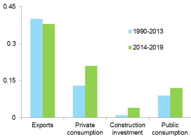
Figure 2 – Germany: Average contributions to quarterly GDP growth (ppt)