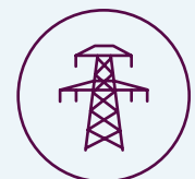
INDEPENDENT SYSTEM OPERATORS