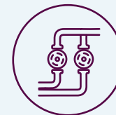
COMMODITY PROCESSING AGREEMENTS